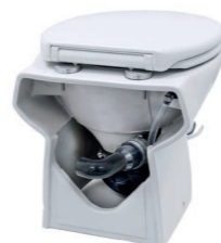
Other options for discharge