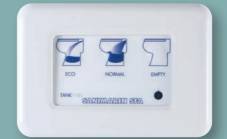
The electronic keyboard Luxe