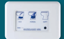
The electronic keyboard Luxe