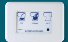
The electronic keyboard Luxe