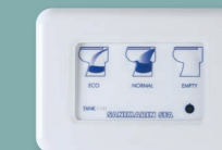
The electronic keyboard Luxe