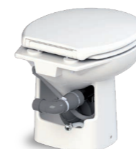
Other options for discharge